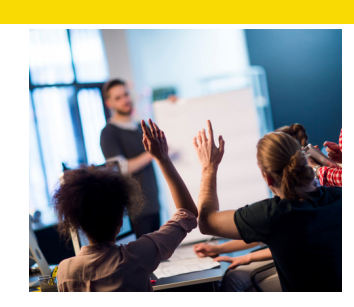
PREPARING AND DELIVERING YOUR PRESENTATION HANDLING QUESTIONS FEEDBACK PROCESS