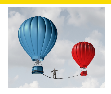
MANAGING CHANGE & CHALLENGES