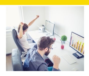
INTEGRATION OF EXCEL AND POWERPOINT