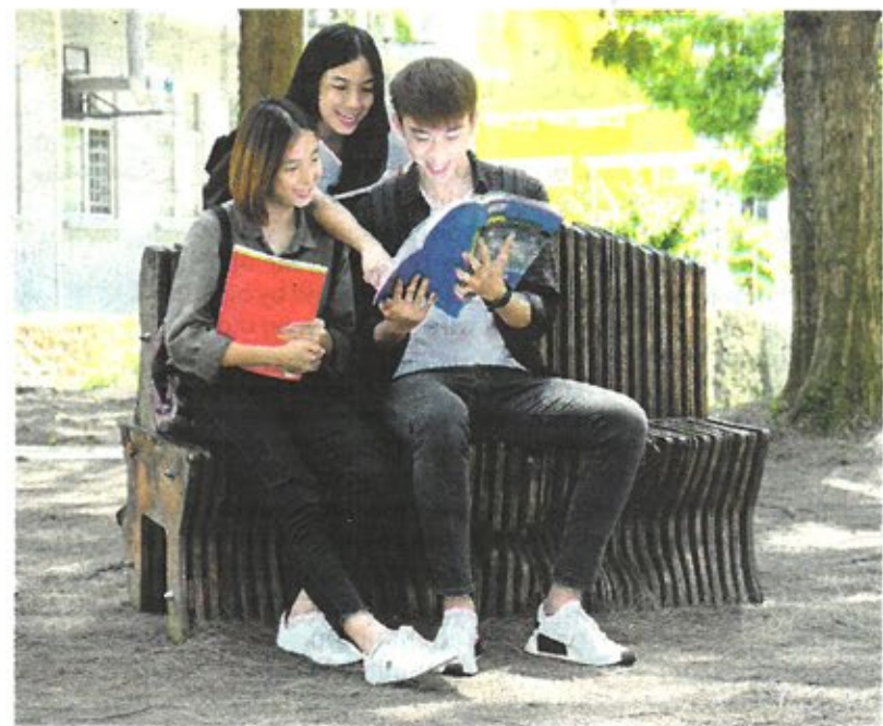
The Centre for Pre-University Studies programmes provide students with a solid grounding as they advance their studies at the undergraduate level.