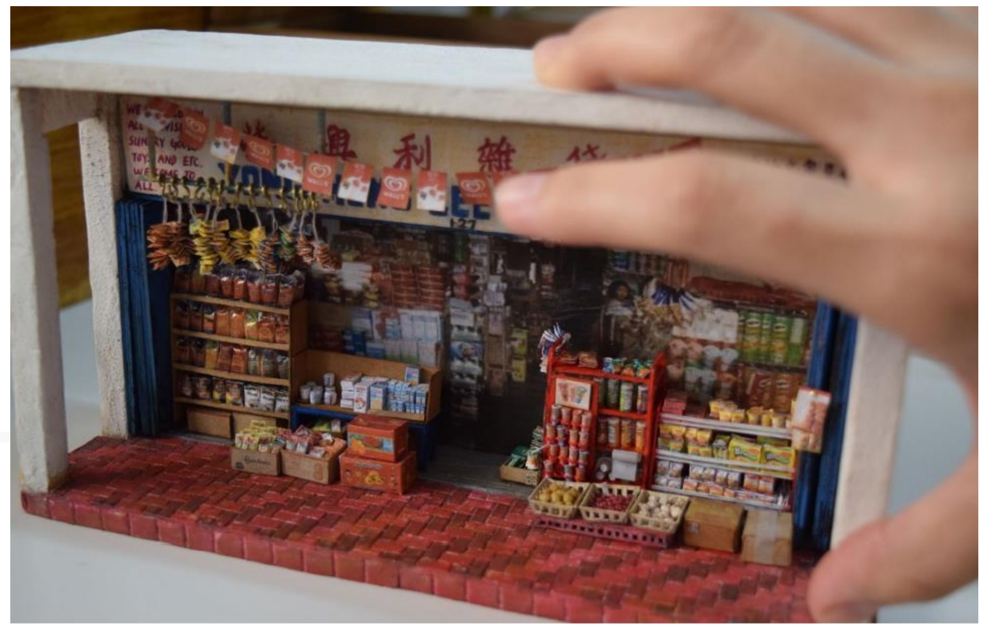
An old shophouse in Singapore

This was my first commissioned work, and it was from someone in Singapore who wanted to recreate her grandfather's provision shop. She had a lot of good memories of the shop as she used to play around the neighbourhood when she was a kid. The shop operated for 35 years before it closed due to dwindling business. It was challenging to create this artwork as I only had old photos for reference. I had a lot of discussions with my client about the facade and the wares it sold. She was able to present it to her grandpa on his 80th birthday and I was very pleased to have been able to share this happiness with the family.