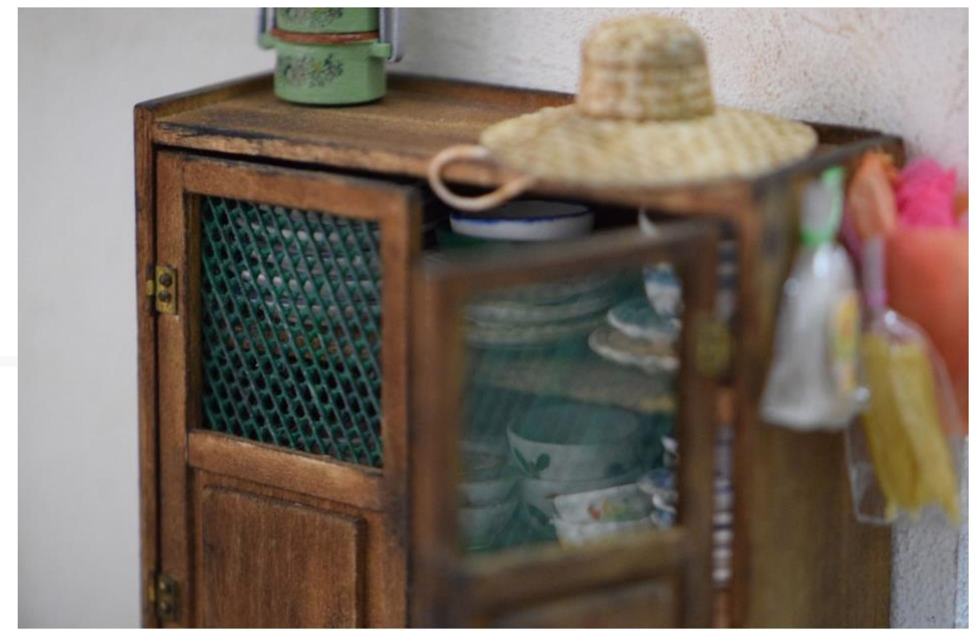
An olden day kitchen cabinet in Lim's grandmother's home

This work is inspired by my grandma's kitchen in Mantin, Negeri Sembilan. We used to go back there every month, and my grandma would cook my favourite kampung chicken dish. I remember with much fondness the wooden cabinet and the accessories it held in the kitchen.